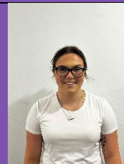
Eve - RSW

Amy works part time a couple of evenings in the week and a shift over the weekend